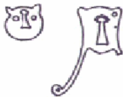
cat key hole covers.

With its rich colours, gilding and carving the altarpiece contrasts with the relatively plain interior of the church and is designed to focus attention on the altar and sanctuary