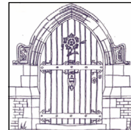
Front Door to Presbytery : sketch

The carving over the front door of the presbytery is regarded as being a fine early example of Art Nouveau decoration