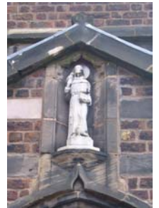
Statue of St Francis

St Francis is closely linked with the story of St Clare.