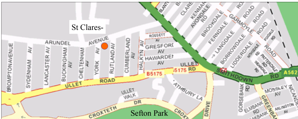
St Clares Church : Arundel Avenue : Sefton Park : Liverpool