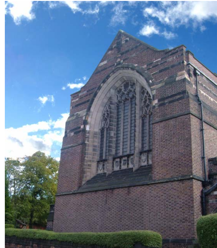
St Clares, Arundel Avenue, Sefton Park Liverpool