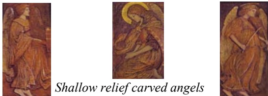
Shallow relief carved angels